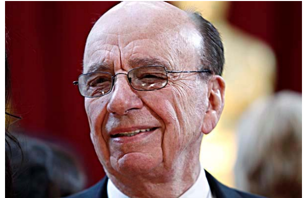
All the way to the bank: Rupert Murdoch's personal wealth nearly doubled last year.

"Major employers such as Woolworths made a $1.1 billion profit in the last six months. They can clearly afford to give low paid workers a decent pay rise - much more than what they are offering.